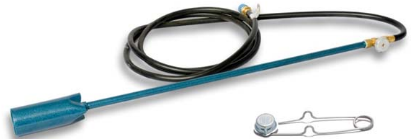
FV-200-K Torch Kit Shown