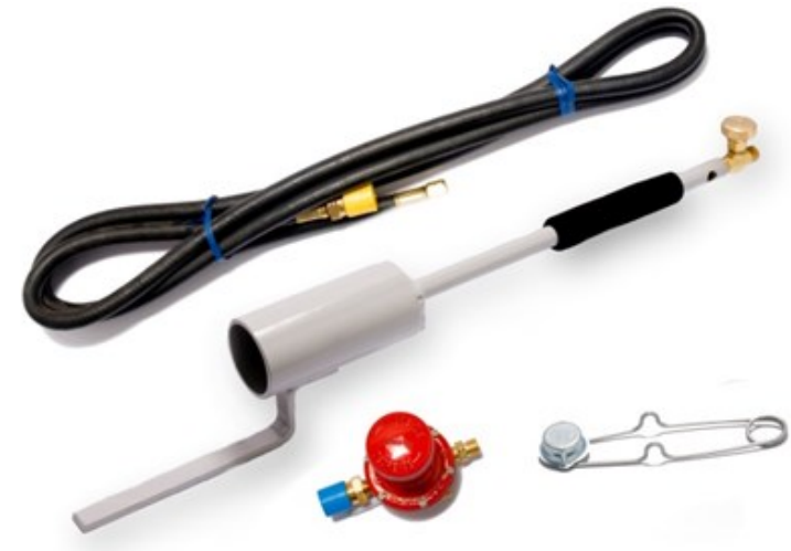
FV-11-S-K Torch Kit Shown

FV-11-S, FV-20, FV-21, FV-30, FV-31 and FV-50